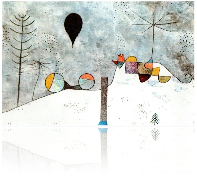
Image for Christmas card 2023 'Winterbild' by Paul Klee