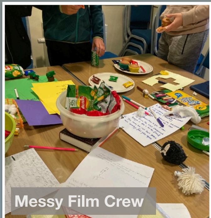
Messy Film Crew