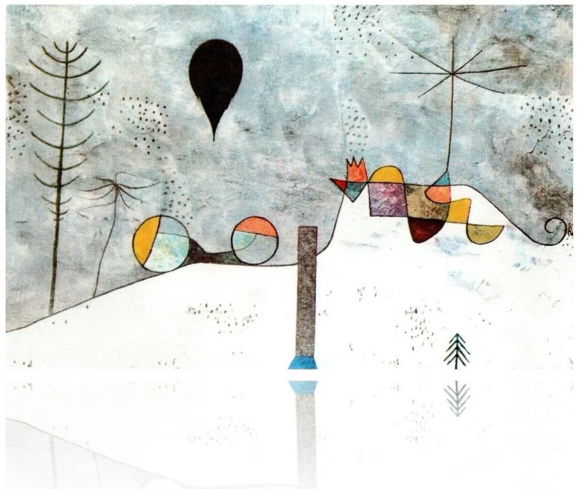
Image for Christmas card 2023 'Winterbild' by Paul Klee